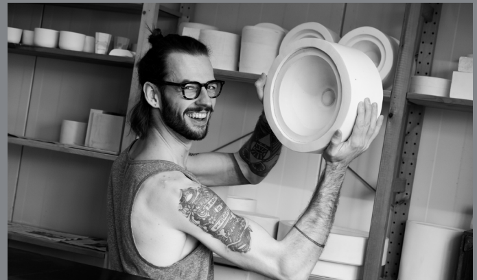
Portrait of me holding a mould, by Silvia Arenas.

With the playful element in my work, I hope to encourage people to look at their surroundings differently. With the choices in color and material, I aim to surprise people by drawing their attention to the details. Ultimately, my goal is to increase the appreciation for everyday objects. When you drink from a cup or eat from a plate, I want you to be able to enjoy that moment more because of the objects you use.