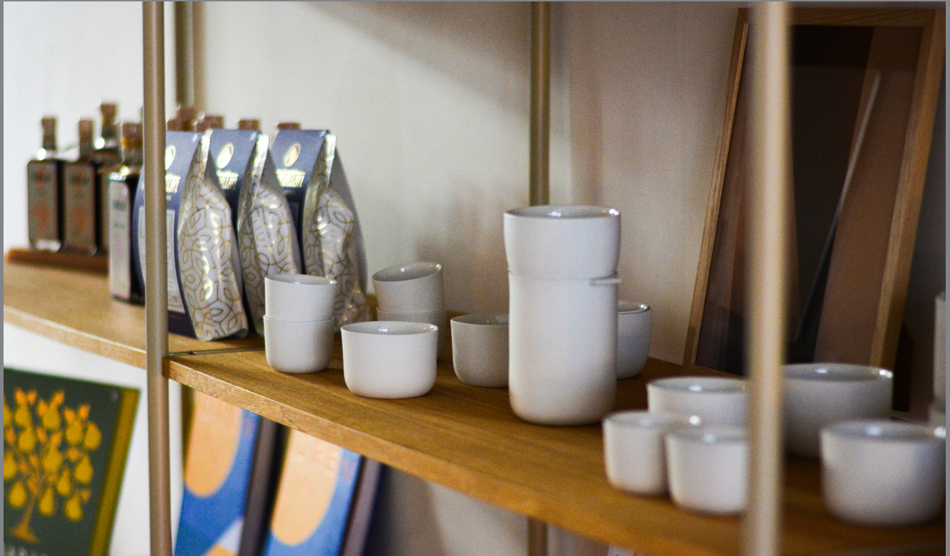
Essence cups and jug at Blend Artwork + Coffee.